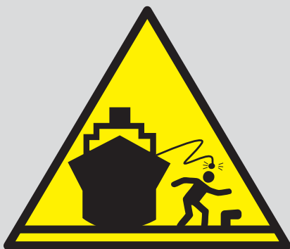
Peligro: caída de sirga.